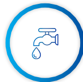
Water supply, sewerage, waste management and remediation activities