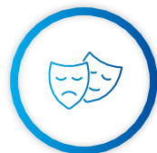
Arts, entertainment and recreation