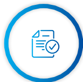
Administrative and support activities