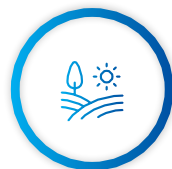
Agriculture, forestry and fishing