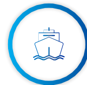
Transportation and storage