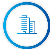
Real estate activities