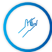
Human health and social work activities