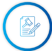
Public administration, defence and compulsory social security