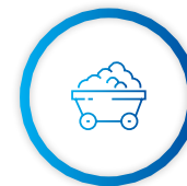
Mining and quarrying