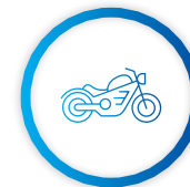
Wholesale and retail trade; repair of motor vehicles and motorcycles