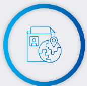
Ethnic or social origin