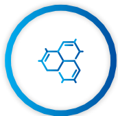
Professional, scientific and technical activities