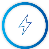
Electricity, gas, steam and air conditioning supply