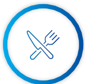
Accommodation and food service activities

The amendments introduce a definition for "sector" that means "an industry or service or part of any industry or service". Eighteen economic sectors have been identified: