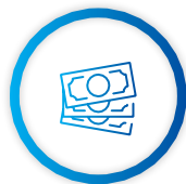
Financial and insurance activities