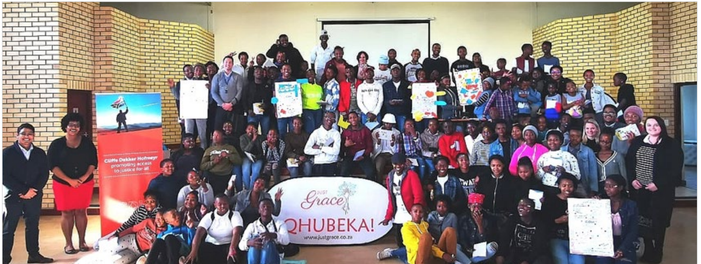
Youth Empowering Youth workshop