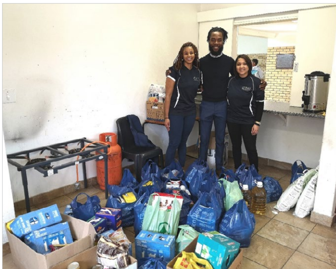
Winter Drive donation delivery and cooking session